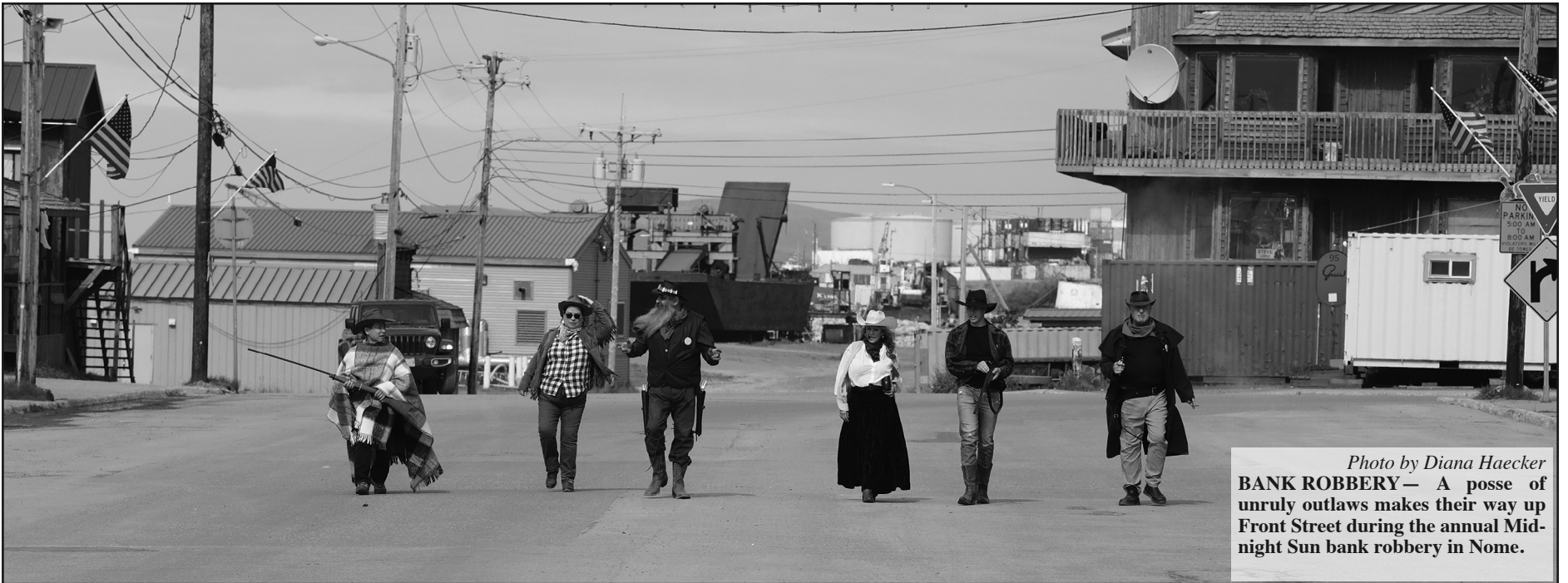
BANK ROBBERY— A posse of unruly outlaws makes their way up Front Street during the annual Midnight Sun bank robbery in Nome.