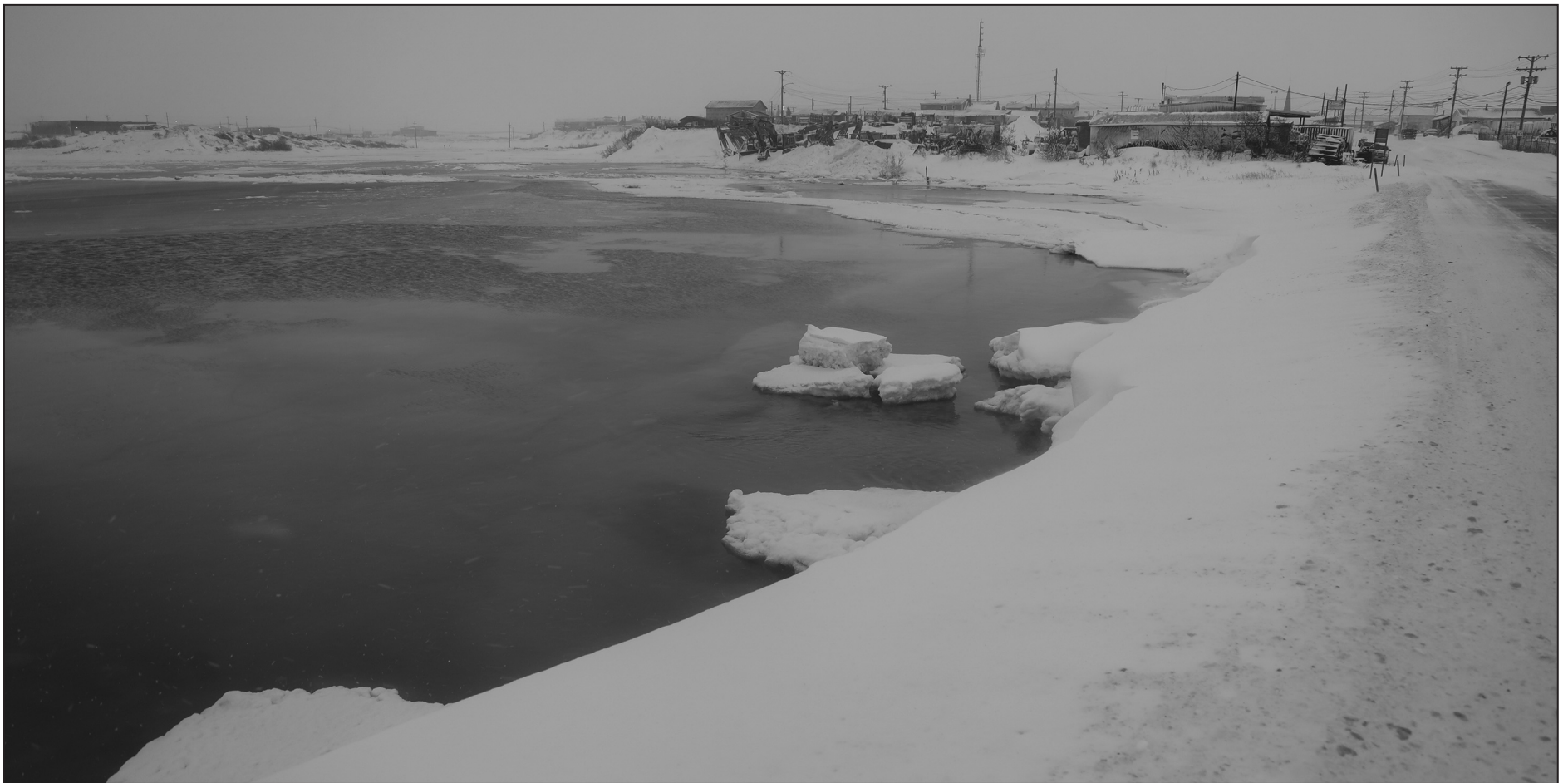
DRY CREEK— Strong south winds pushed water onto Dry Creek next to Seppala Drive on Monday, December 6.