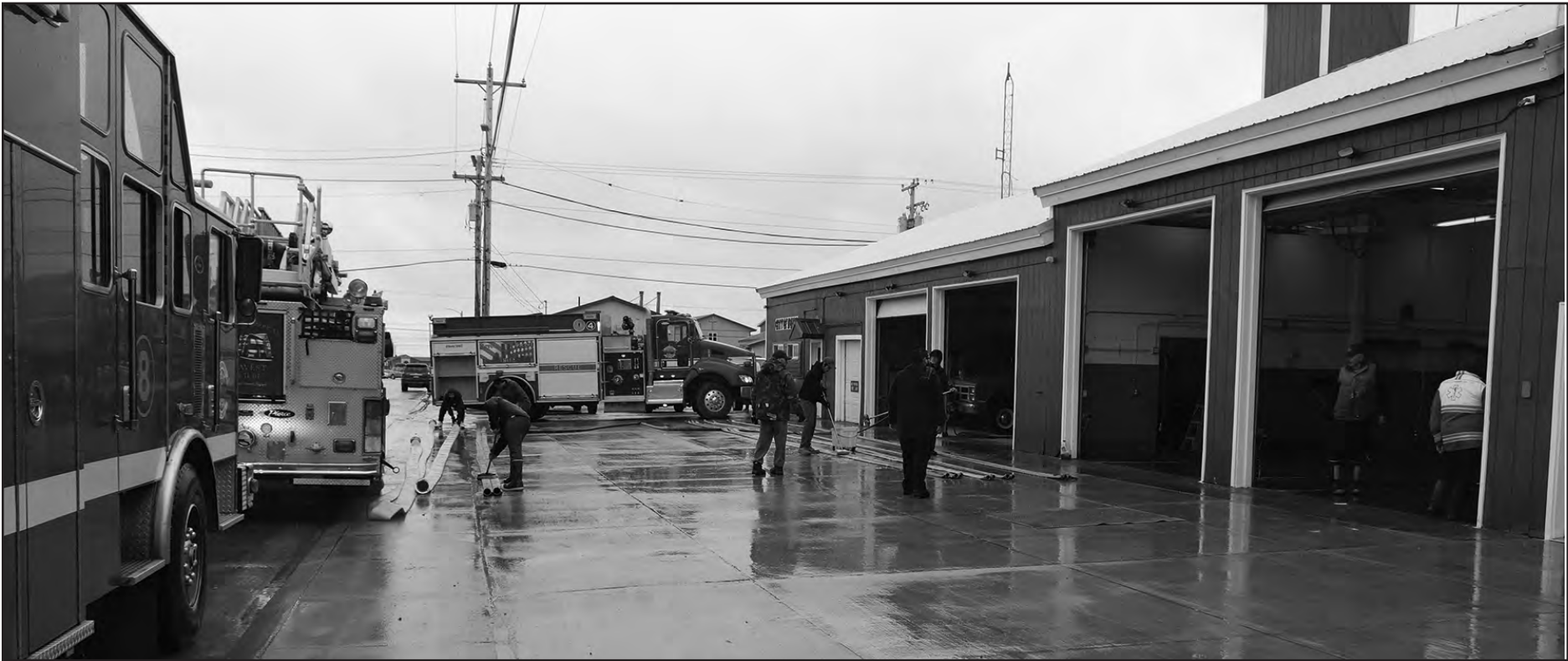
CLEANING UP— Seaside residents help NVFD to clean up the fire hoses after the fire, on Sunday, Sept. 18.