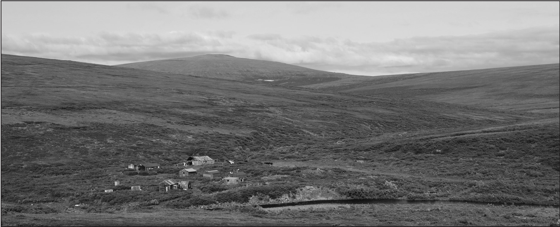
SULLIVAN CAMP— Sullivan Camp and Gold Run Creek along the Bob Blodgett Highway on July 11.