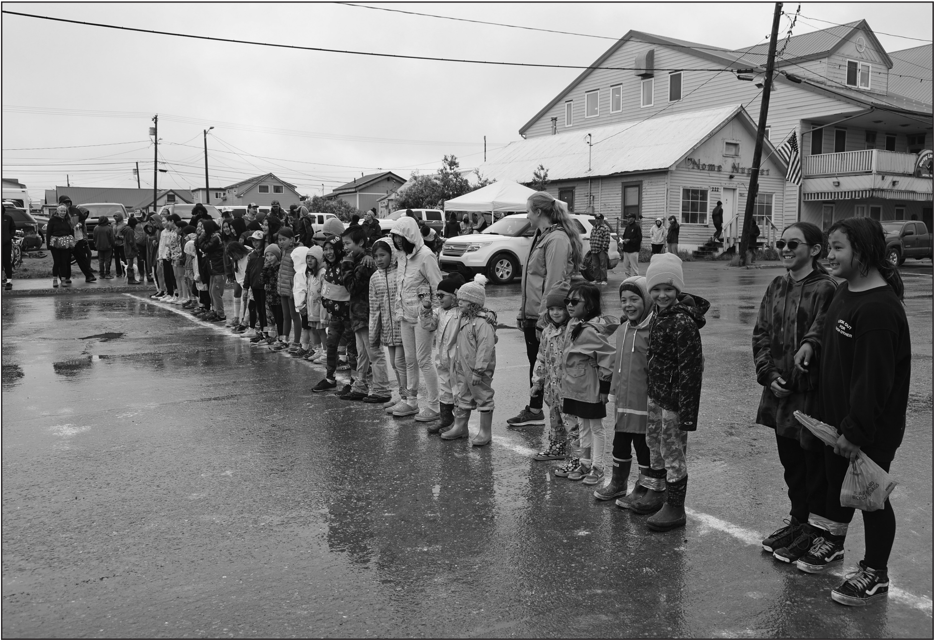
THREE-LEGGED RACE— Participants in the three-legged race line up on Front Street in Nome on Monday, July 4th.